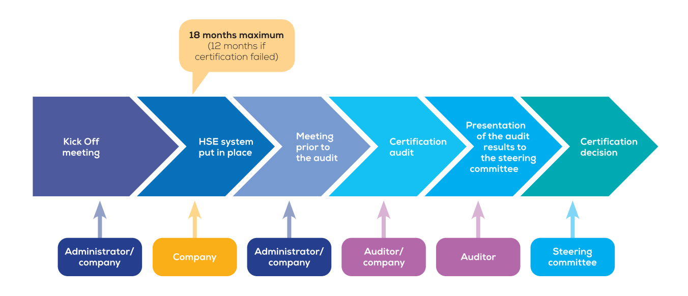
Diagram of the stages of the MASE/France Chimie common system certification process

The methods of preparing, carrying out and reporting a certification audit are specified in "Inter MASE" procedures no. 3 and no. 5.